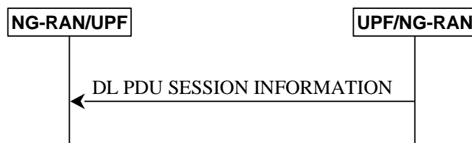
Figure 5.4.1.1-1: Successful Transfer of DL PDU Session Information

When needed, the NG-RAN shall propagate the DL PDU Session Information to a peer NG-RAN.