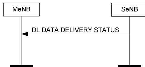
Figure 5.4.2.1-1: Successful Downlink Data Delivery Status

After being reported to the MeNB, the SeNB removes the respective PDCP sequence numbers.