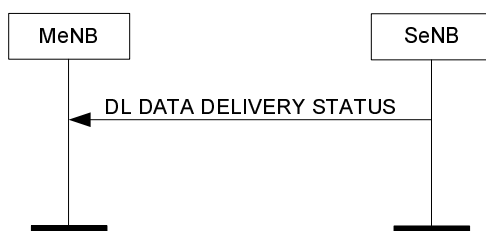
Figure 5.4.2.1-1: Successful Downlink Data Delivery Status

After being reported to the MeNB, the SeNB removes the respective PDCP sequence numbers.