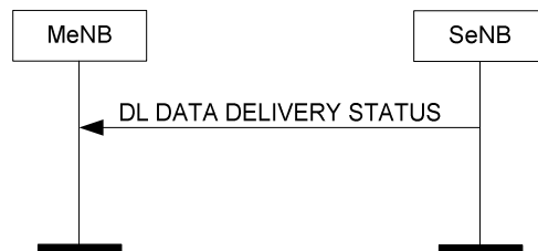
Figure 5.4.2.1-1: Successful Downlink Data Delivery Status

After being reported to the MeNB, the SeNB removes the respective PDCP sequence numbers.