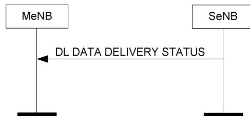
Figure 5.4.2.1-1: Successful Downlink Data Delivery Status

After being reported to the MeNB, the SeNB removes the respective PDCP sequence numbers.