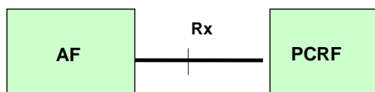
Figure 4.2.1: Rx reference model

The Rx reference point is defined between the PCRF and the AF. The relationships between the different functional entities involved are depicted in figure 4.2.1. The overall PCC architecture is depicted in clause 3a of 3GPP TS 29.213 [9].