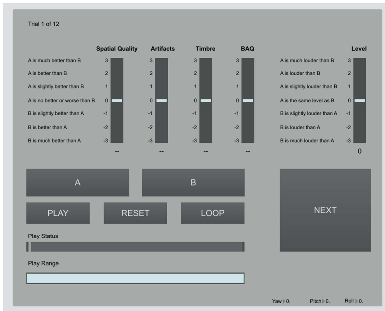
Figure 1: Example of possible GUI for Rendering Comparison Test