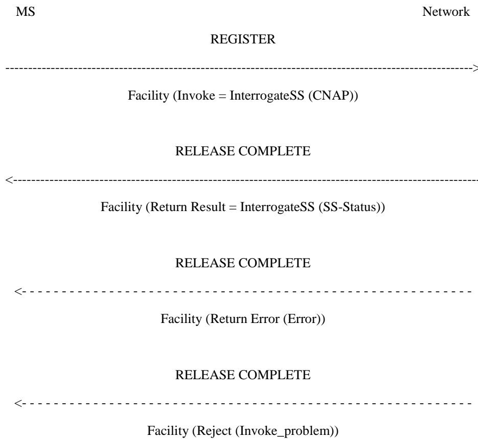
Figure 2: Interrogation of calling name identification presentation