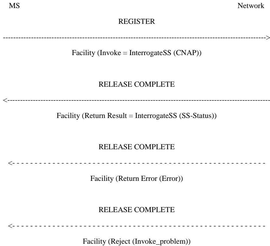
Figure 2: Interrogation of calling name identification presentation

The mobile subscriber can request the status of the supplementary service and be informed if the service is provided to him/her.