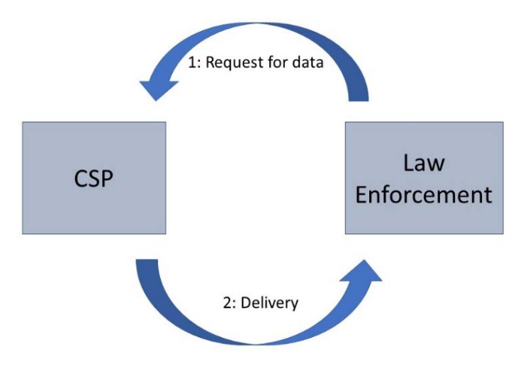
Figure 1: Reference model

Request means submission of a request for data and delivery means handover of the material that was identified by the CSP as meeting the request. Figure 1 shows the reference model.