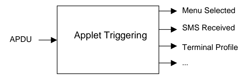
Figure 3: toolkit applet triggering diagram

The application triggering portion of the SIM Toolkit Framework is responsible for the activation of toolkit applets, based on the APDU received by the GSM application.