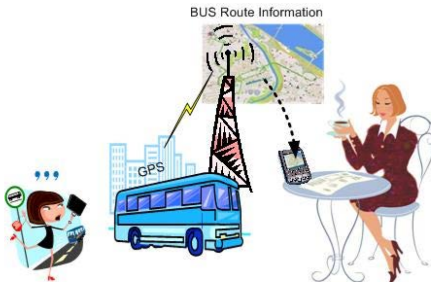
Figure 3 Use Case for Public Transport Information Service