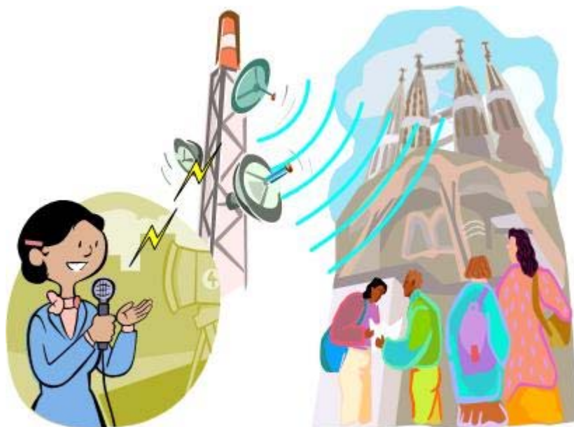
Figure 2 Use Case for Guided Tour

For example in a guided tour, a tourist guide use mobile device for speaking group of tourists instead of using noisy amplifier. Streaming audio[9][10] as well as multimedia information, electronic tickets for entering tourist sites can be distributed. The location information of the tourist guide is constantly broadcast that the tourists may keep track of the guide when they are spread in large area. Paging capability of the mobile PBCP is an important function to support because the tourist guide needs to reassemble the group and move to another location. Interactive communication between the mobile PBCP and users also need to be supported.