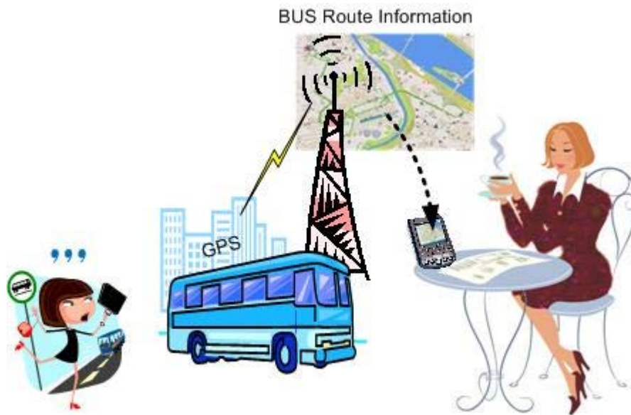
Figure 3 Use Case for Public Transport Information Service