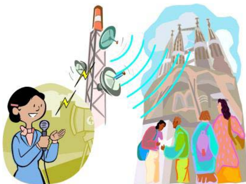
Figure 2 Use Case for Guided Tour

For example in a guided tour, a tourist guide use mobile device for speaking group of tourists instead of using noisy amplifier. Streaming audio[9][10] as well as multimedia information, electronic tickets for entering tourist sites can be distributed. The location information of the tourist guide is constantly broadcast that the tourists may keep track of the guide when they are spread in large area. Paging capability of the mobile PBCP is an important function to support because the tourist guide needs to reassemble the group and move to another location. Interactive communication between the mobile PBCP and users also need to be supported.