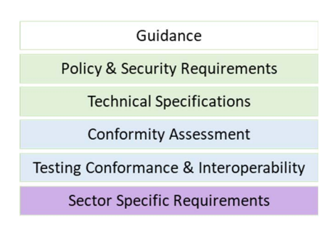
Figure 2: Illustration of document types in the framework for standardization of signatures