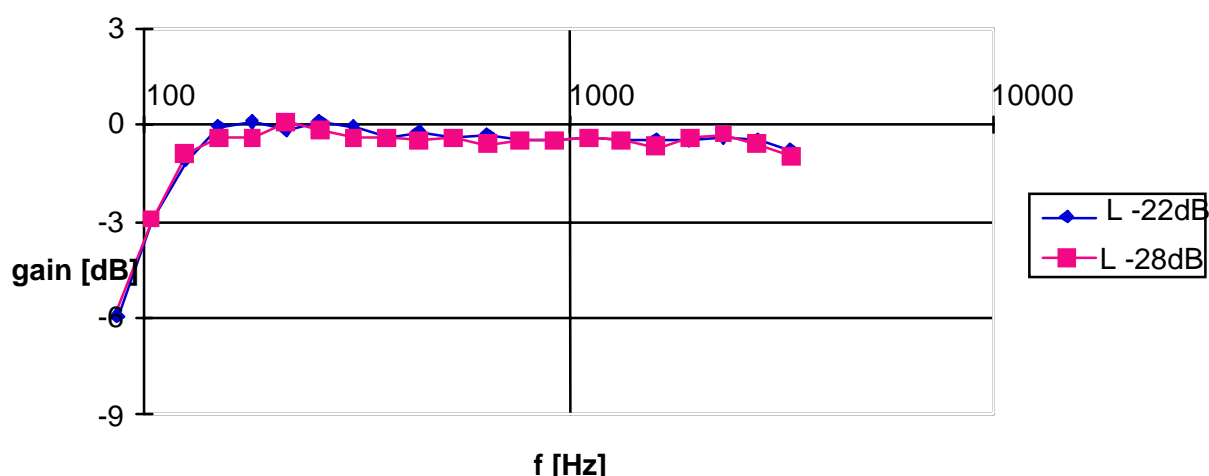
Figure 13: GSM EFR codec frequency response at different input levels

Within the telephony band the frequency response is very flat. No abnormal deviations were observed. Also additional experiments with different input level (-18 dB, -28 dB), or different tone length (500 ms, 4 s) resulted in almost identical curves. The decreasing gain above 3 kHz is relative small and far away from a 3 dB margin. The transition behaviour was very good.