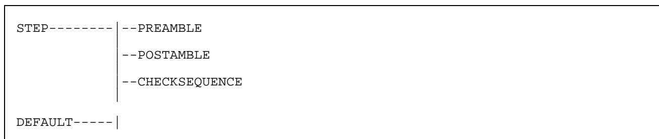
Figure 2: Test Step and Default Structure

The common dynamic behaviour is described in test steps as shown in figure 2. These can be called from any test case.