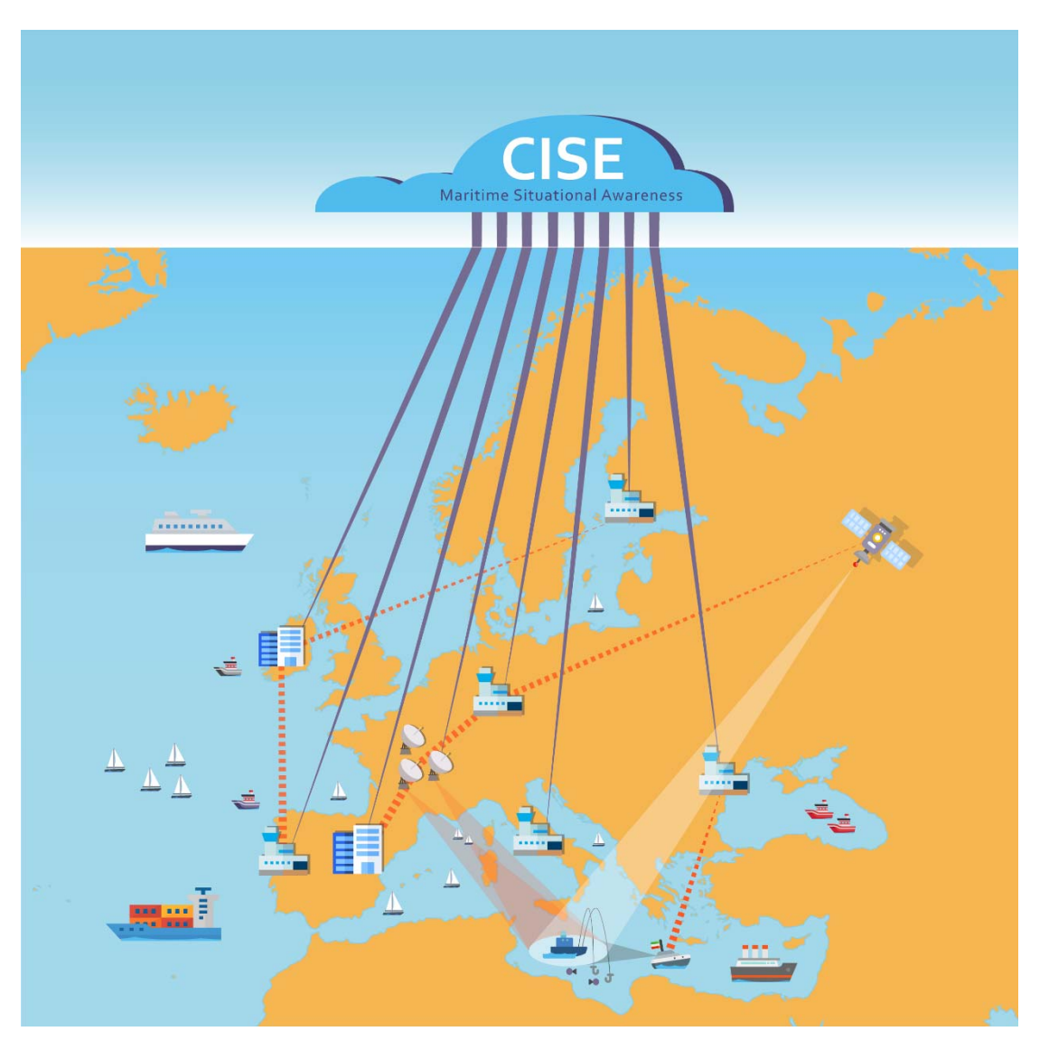
Figure 1: Schematic diagram of the CISE vision

The aim of the integrated maritime surveillance is to generate a situational awareness of activities at sea, impacting on the denominated seven maritime sectors: Maritime Safety and Security, Border Control, Maritime Pollution and Marine Environment Protection, Fisheries Control, Customs, General Law Enforcement, Defence, as well as the economic interests of the EU, so as to facilitate sound decision making.