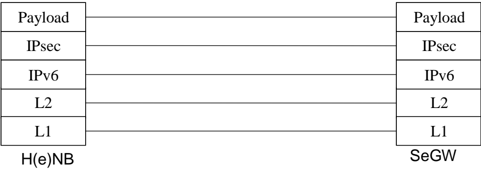
Figure 4.1.2-2: User Plane for H(e)NB - SeGW Interface over IPv6 transport network