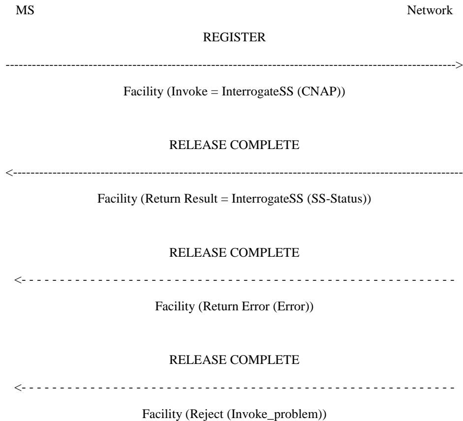
Figure 2: Interrogation of calling name identification presentation

The mobile subscriber can request the status of the supplementary service and be informed if the service is provided to him/her.