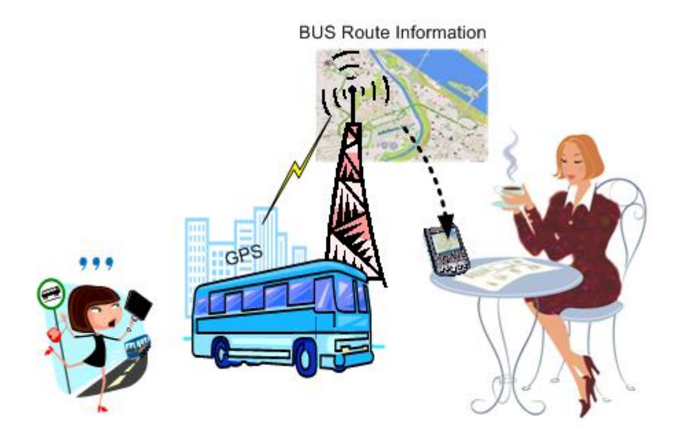
Figure 3 Use Case for Public Transport Information Service