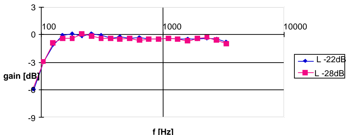
Figure 13: GSM EFR codec frequency response at different input levels