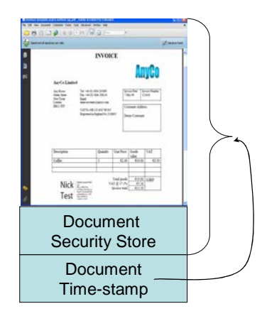
Figure 2: Illustration of PDF document with extended life-time protection

These extensions support Long Term Validation (LTV) of PDF Signatures. The structure of a PDF document with LTV is illustrated in figure 2.