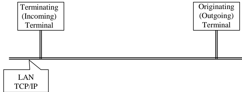
Figure 1: network architecture

The IUT to be tested can be one of the following: Originating (outgoing) or Terminating (incoming) Endpoint. They are a part of a Packet Based Network using a LAN with TCP/IP (see figure 1).