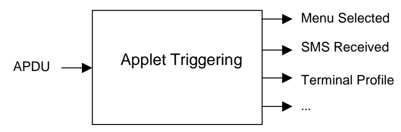
Figure 3: toolkit applet triggering diagram

The application triggering portion of the SIM Toolkit Framework is responsible for the activation of toolkit applets, based on the APDU received by the GSM application.