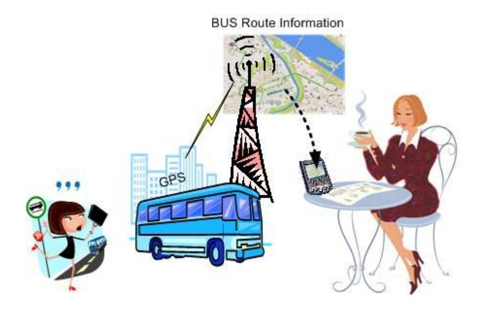
Figure 3 Use Case for Public Transport Information Service