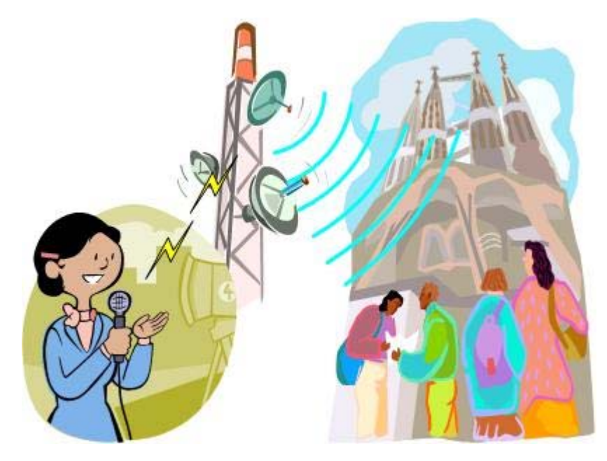
Figure 2 Use Case for Guided Tour

For example in a guided tour, a tourist guide use mobile device for speaking group of tourists instead of using noisy amplifier. Streaming audio[9][10] as well as multimedia information, electronic tickets for entering tourist sites can be distributed. The location information of the tourist guide is constantly broadcast that the tourists may keep track of the guide when they are spread in large area. Paging capability of the mobile PBCP is an important function to support because the tourist guide needs to reassemble the group and move to another location. Interactive communication between the mobile PBCP and users also need to be supported.