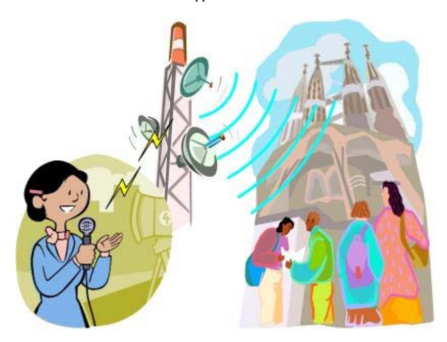
Figure 2 Use Case for Guided Tour

For example in a guided tour, a tourist guide use mobile device for speaking group of tourists instead of using noisy amplifier. Streaming audio[9][10] as well as multimedia information, electronic tickets for entering tourist sites can be distributed. The location information of the tourist guide is constantly broadcast that the tourists may keep track of the guide when they are spread in large area. Paging capability of the mobile PBCP is an important function to support because the tourist guide needs to reassemble the group and move to another location. Interactive communication between the mobile PBCP and users also need to be supported.