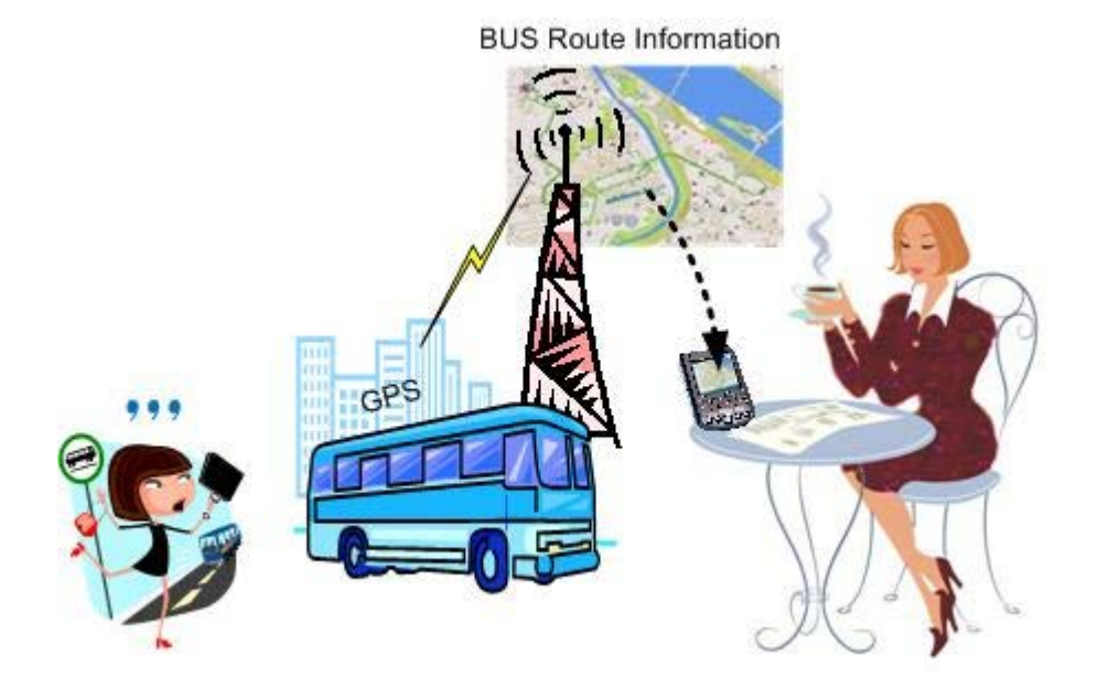
Figure 3 Use Case for Public Transport Information Service