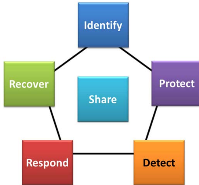
Figure 1: Basic components of the cyber security ecosystem