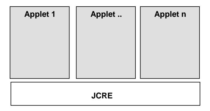
Figure 1: Applets lying over Runtime Environment

In GSM the attractions of the JavaCard<sup>TM</sup> have already been examined and the GSM SIM API toolkit has been captured in an API for the JavaCard<sup>TM</sup> in the ETSI Technical Specification GSM 03.19 (ETS 300 641 [3]).