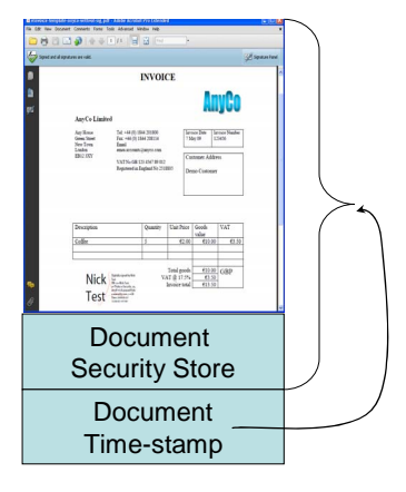
Figure 2: Illustration of PDF document with extended life-time protection

These extensions support Long Term Validation (LTV) of PDF Signatures. The structure of a PDF document with LTV is illustrated in figure 2.