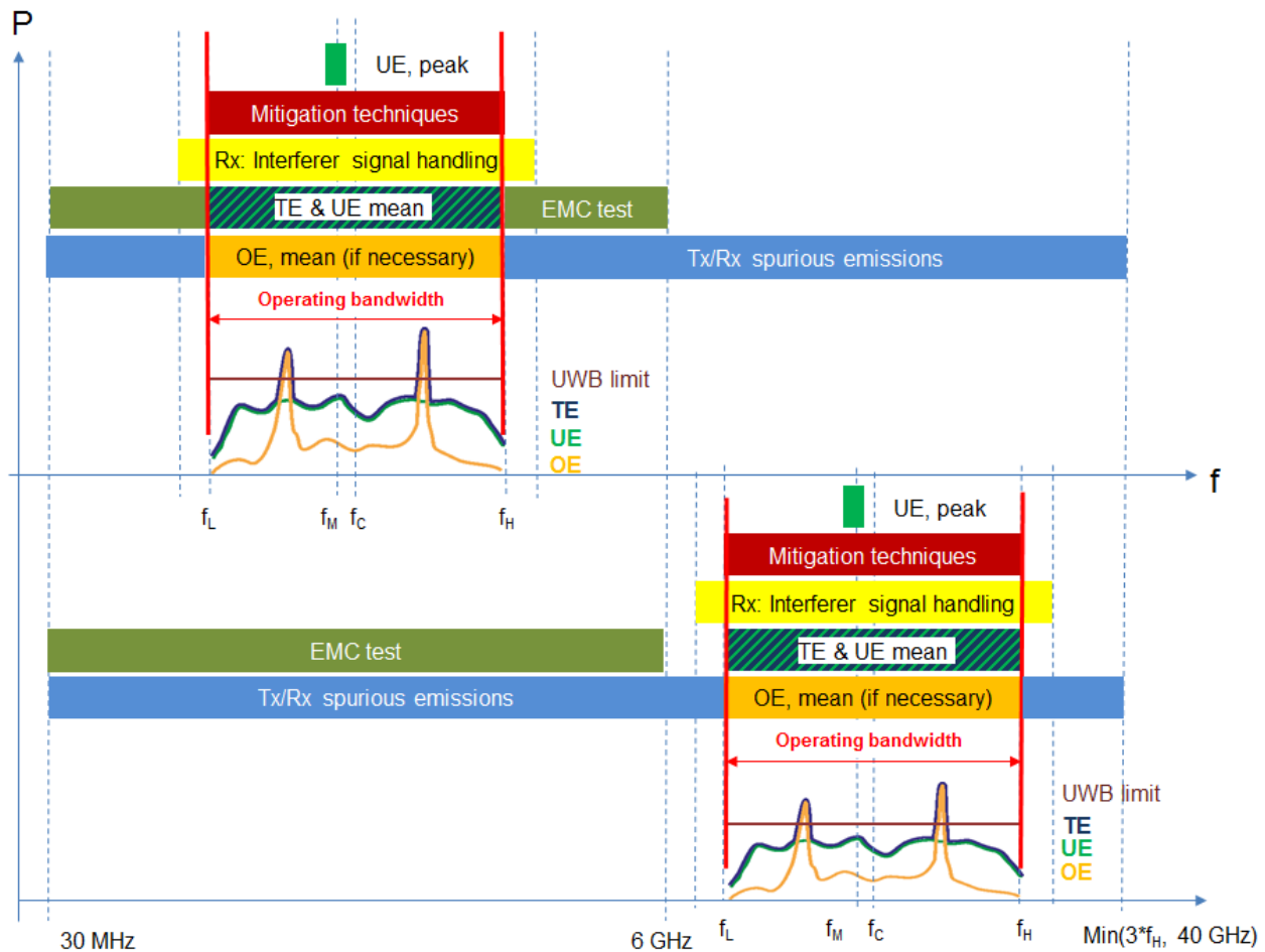
Figure 1: Concept of operating bandwidth including the relevant UWB related parameter