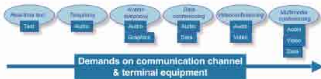
Figure 1: Main real-time person-to-person communication media and services