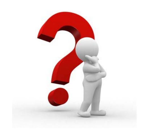
One-fits-all will not work!